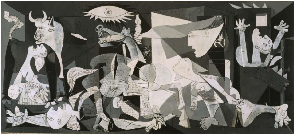
Guernica, 1937 Pablo Picasso, 1881-1973 Oil on canvas

Task: Each cup has a different intensity of black, from very light grey to very dark. Paint an image that includes watercolor from each cup.