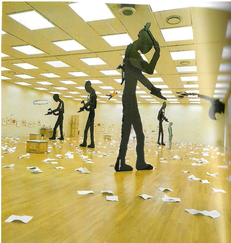
Hammering Men , 1984 Jonathan Borofsky, 1942 Acrylic on wood, aluminum, steel, with motor

Task: Layer the cut outs to create a sense of depth with some things looking close and some looking farther away.