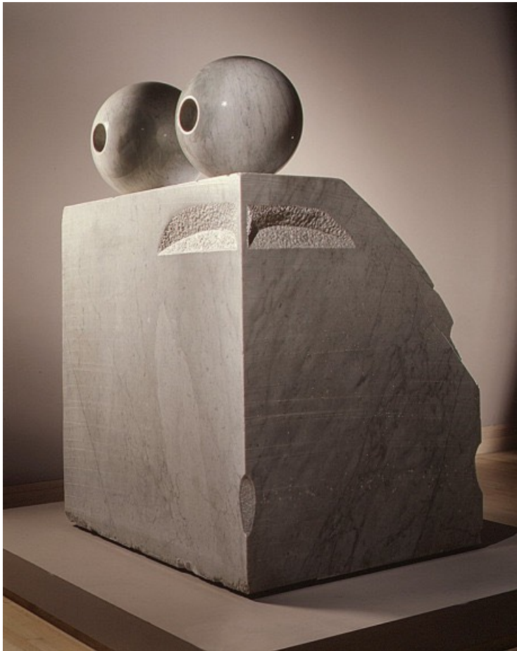
Eyes , 1982 Louise Bourgeois, 1911-2010 Marble

Add indentations or change the form completely. Observe the light and shadows of these different forms.