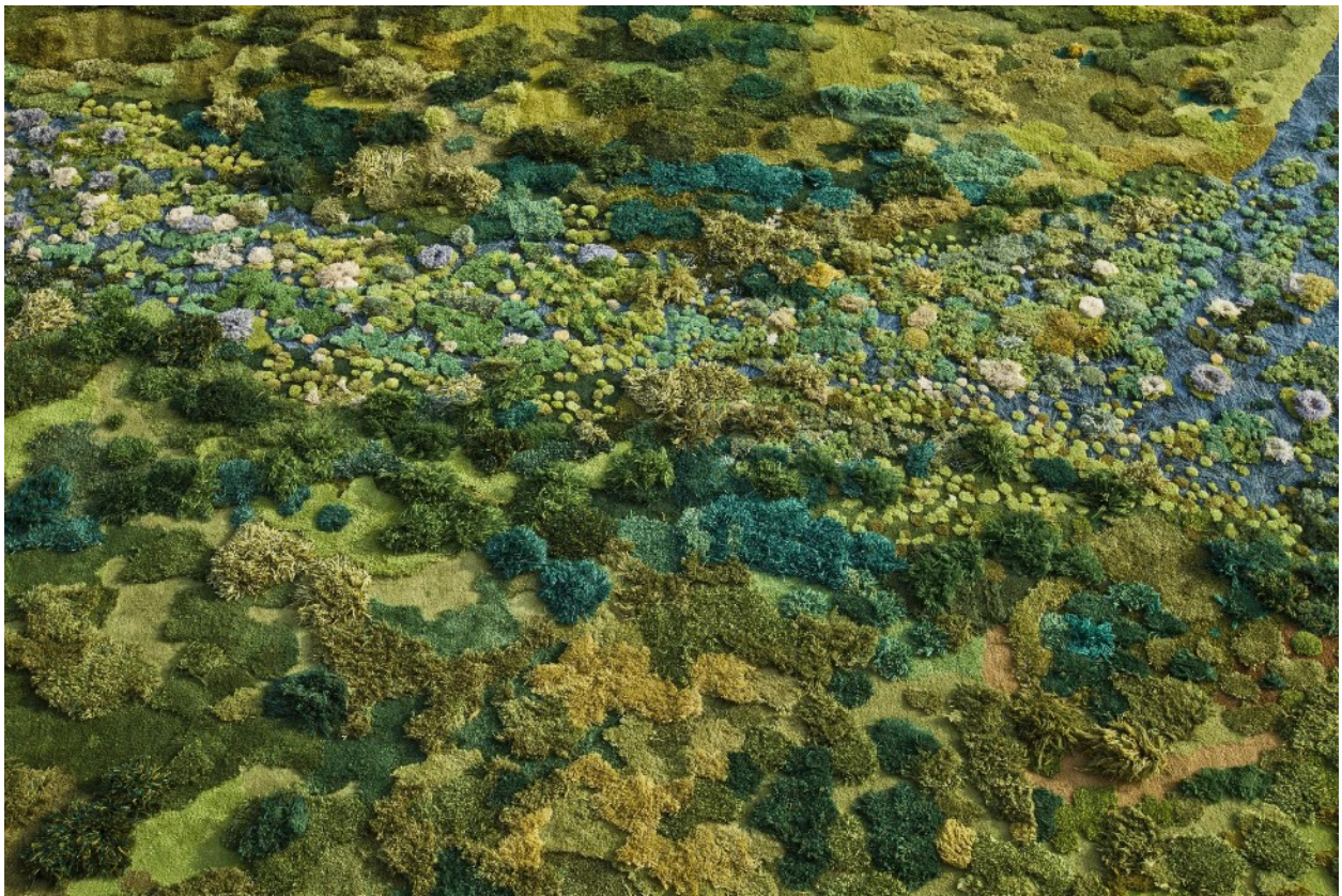
No Longer Creek , 2016 Alexandra Kehayoglou, 1982

Task: Create a landscape or abstract picture on the tray using the various materials.