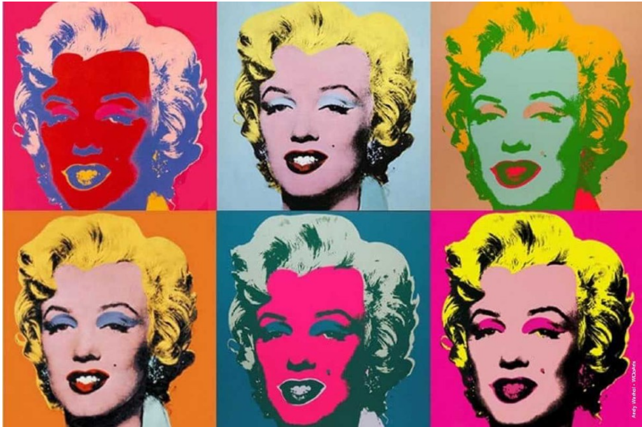
Marilyn Monroe, 1962-1967 Andy Warhol Silkscreen print

Task: Create 4 identical images using different color schemes. Swap the cutouts to try different color schemes.