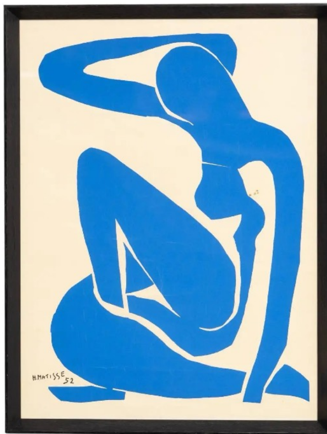
Nu Bleu I, 1970 Henri Matisse Cut out blue lithograph